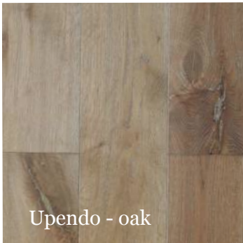
Upendo - oak