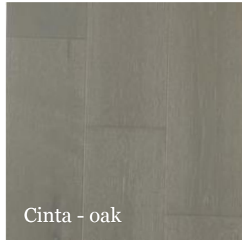
Cinta - oak